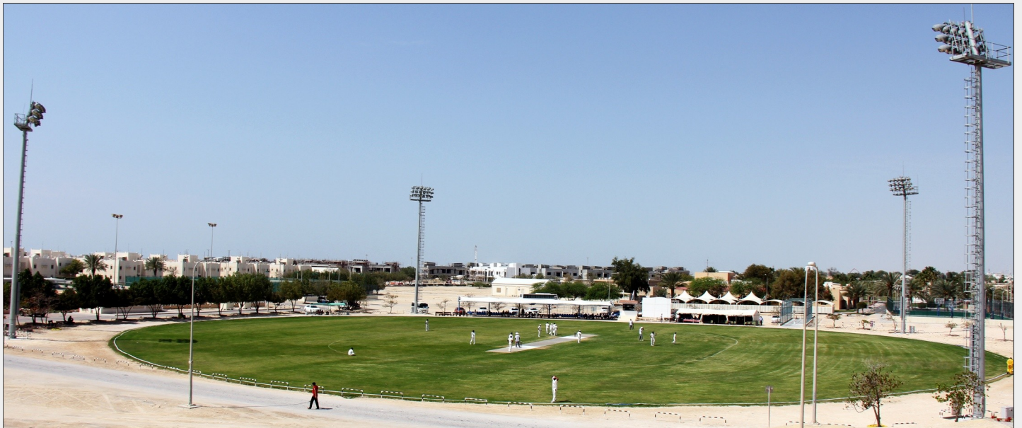
Dukhan Cricket in 2014.