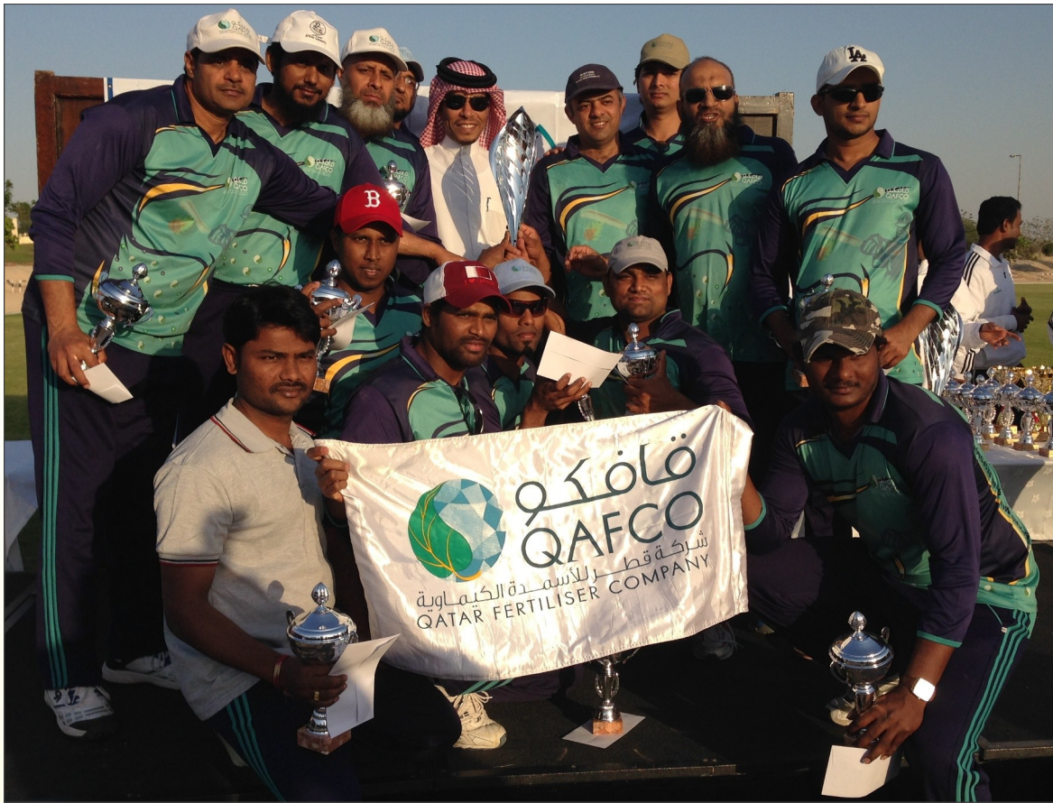
QAFCO runner-up team.

participating teams for their dedication, and the officials and volunteers for their highest possible commitments and standards.