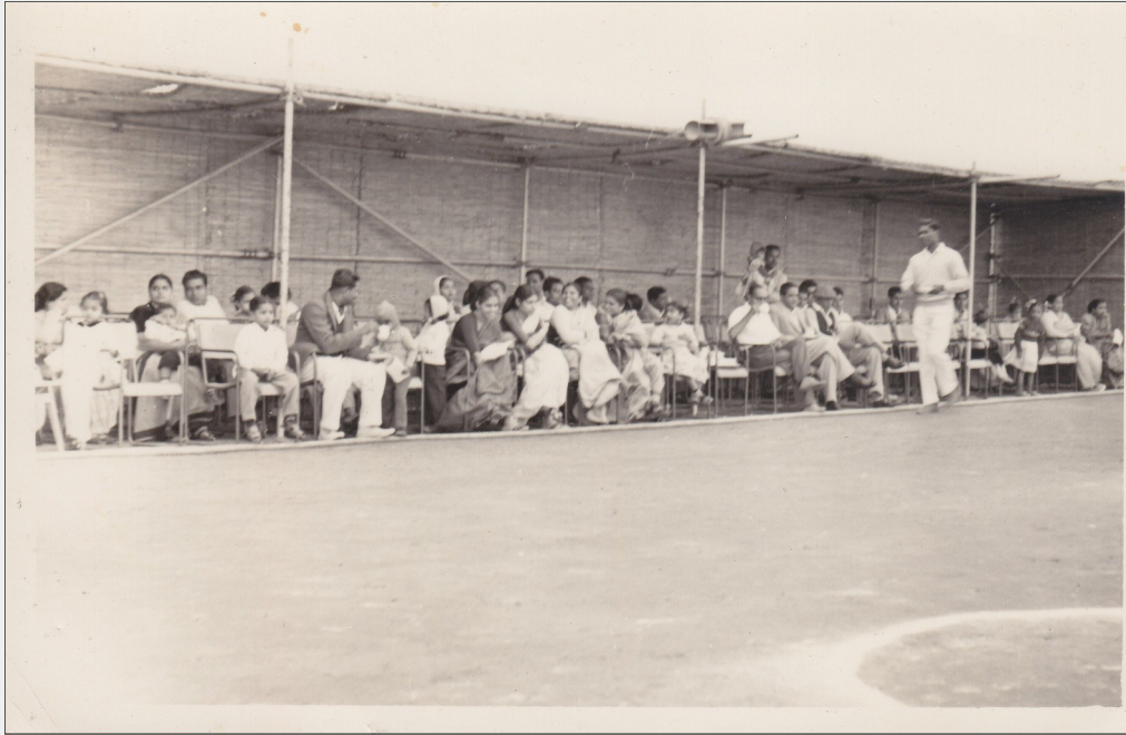
Dukhan Cricket in 1959, families enjoying a game of Cricket.