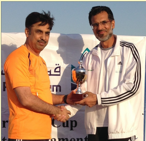
Team ORYX GTL was awarded The Cricket Spirit Award.