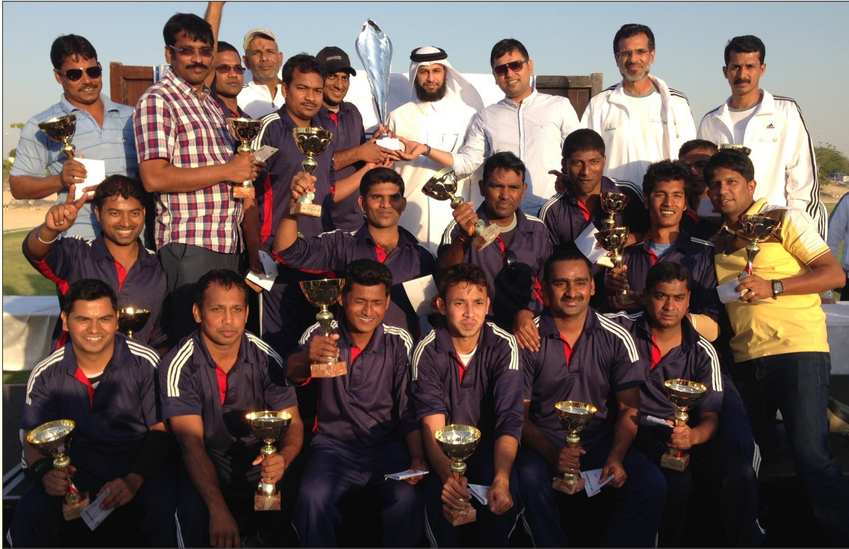
Mabrook! to Amwaj B team for being crowned the Champions!

10 th Chairman's Cup Cricket Tournament, the most awaited event for Oil & Gas Industries cricket communities in Qatar, clapped on, on 07 th February 2014. With 24 teams from various departments of Qatar Petroleum and its subsidiaries locking horns at a total 64 matches, the event continued for 9 weeks taking on every Friday and Saturday.